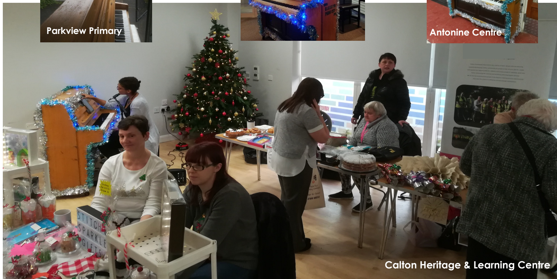
Calton Heritage & Learning Centre