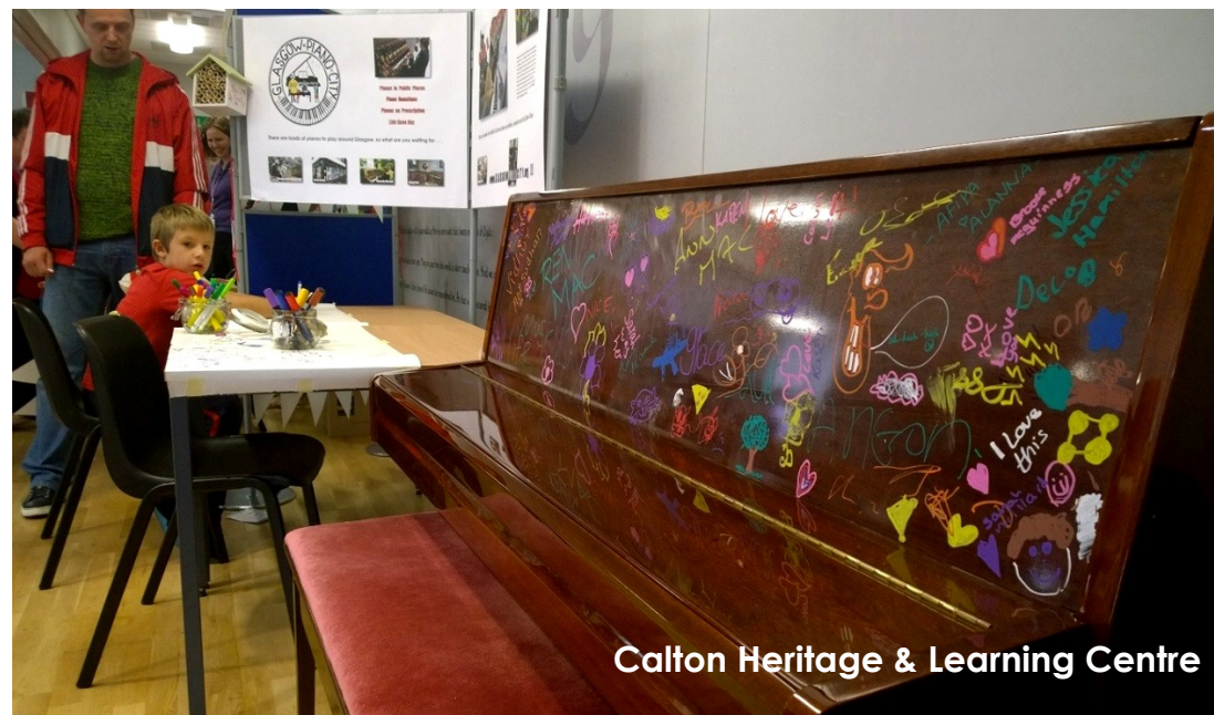
Calton Heritage & Learning Centre