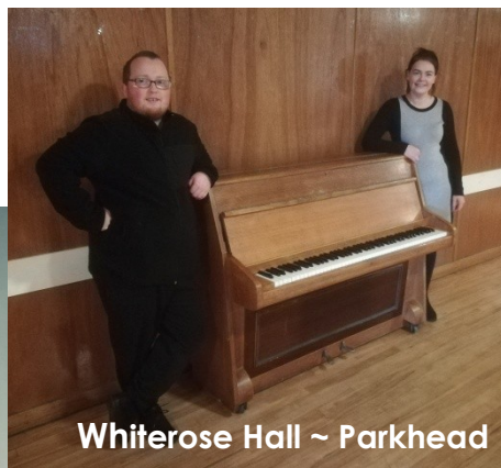
Whiterose Hall ~ Parkhead

Piano donations have arrived in the East End from all over the city and outside too: Kirkintilloch, Stirling, Shawlands Mount Florida, Trongate, Drumchapel and Govanhill.