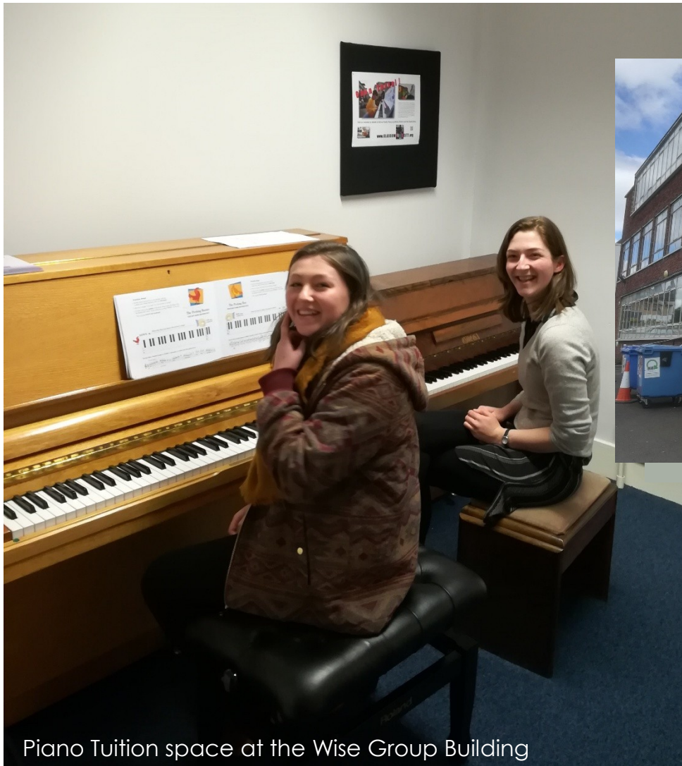
Piano Tuition space at the Wise Group Building