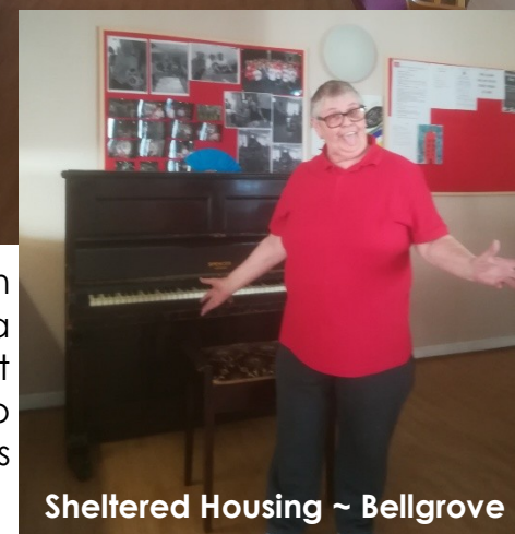
Sheltered Housing ~ Bellgrove

In the area around the Calton boundary we have facilitated more piano donation installations to venues including: Bridgeton Community Learning Campus and a Residential Care Unit ( with a highly motivated piano tuition recipient ), Sword Street Sheltered Housing complex in Bellgrove ( with an blind female resident delighted to play again ) Whiterose Community Hall in Parkhead where the local Playbusters have been making good use their piano for their music club.