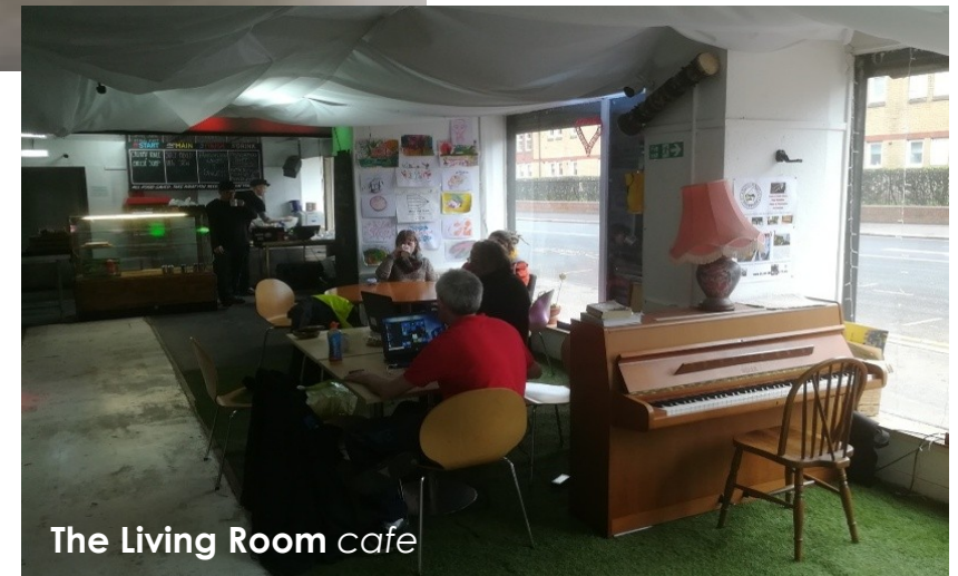
The Living Room cafe