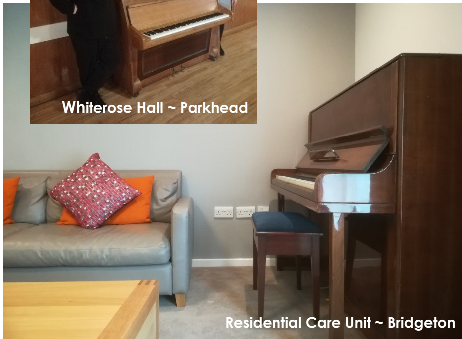
Residential Care Unit ~ Bridgeton

Piano donations have arrived in the East End from all over the city and outside too: Kirkintilloch, Stirling, Shawlands Mount Florida, Trongate, Drumchapel and Govanhill.