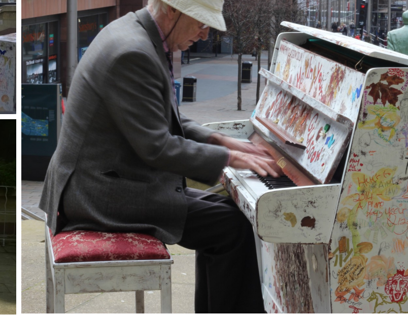
I think we're going to need a bigger stool!