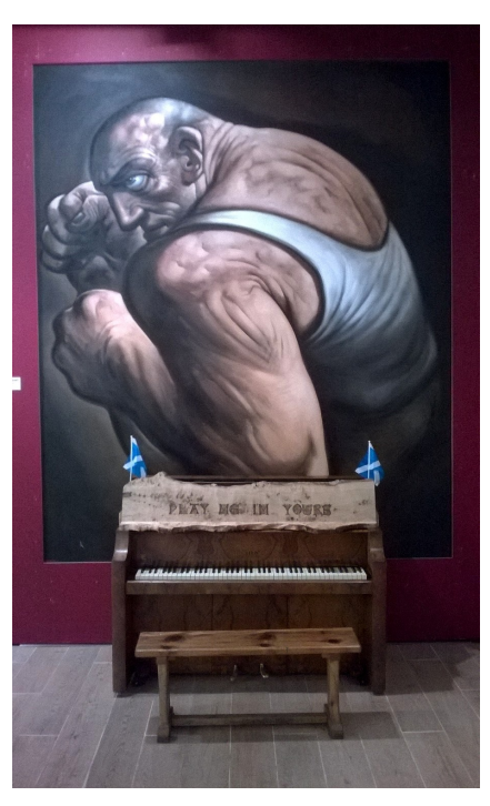
During the 2014 Glasgow Music Festival of the Piano ~ twelve of the GPC instruments were gathered together at Glasgow Royal Concert Hall for people to play and enjoy. They proved to be a resounding hit with visitors & staff alike. 'Calisia' & 'Floyd' remain available to play all year.