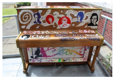
'Bart' leaves the Douglas Academy practice rooms for the Gallus Games . . . before visiting Royston Library for a day.