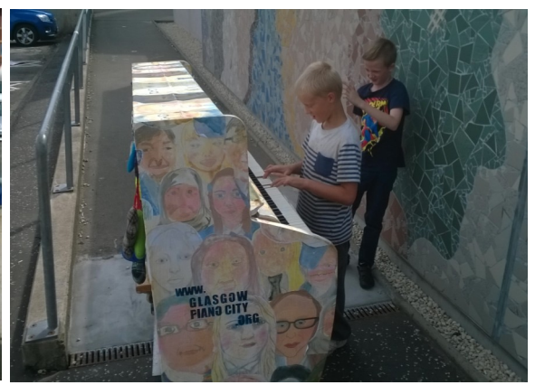
'Rod' leaves his corridor in Bearsden Academy for the Lillie Art Gallery before getting strapped back into the van and heading straight to Easterhouse for the next QBR event.