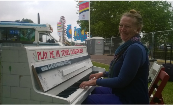
Nestled in the trees, near the Peoples Palace was 'Floyd' in the Glasgow Green Live Zone. You could also find him in the shade, in his wee pavilion, where he was free for choirs & bands to perform with too . . . as well as anyone taking a break from the entertainment & ice cream.